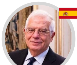
Josep Borrell (S&D) High Representative & Vice President