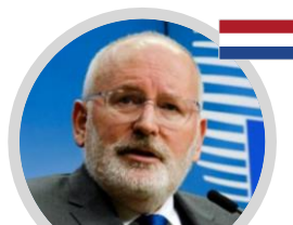
Frans Timmermans (S&D) Executive Vice-President for Green Deal