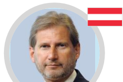
Johannes Hahn (EPP) Budget and Administration