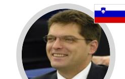
Janez Lenarcic (Ind.) Crisis Management