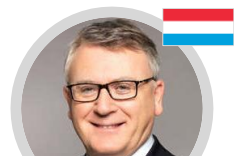
Nicolas Schmit (S&D) Jobs