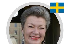
Yvona Johansson (S&D) Home Affairs