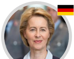
Ursula von der Leyen (EPP) President