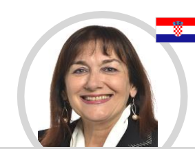
Dubravka Suica (EPP) Vice-President for Democracy and Demography