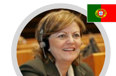
Elisa Ferreira (S&D) Cohesion and Reforms