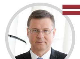
Valdis Dombrovskis (EPP) Executive Vice-President for Financial Services