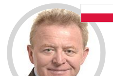
Janusz Wojciechowski (ECR) Agriculture