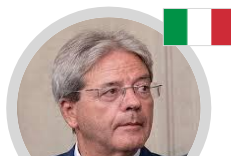
Paolo Gentiloni (S&D) Economy