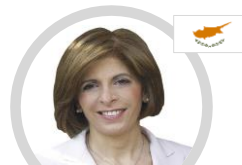
Stella Kyriakides (EPP) Health