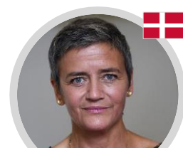
Margrethe Vestager (RE) Executive Vice-President for Digital and Competition