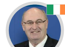
Phil Hogan (EPP) Trade