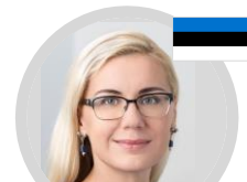
Kadri Simson (RE) Energy