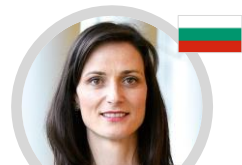
Mariya Gabriel (EPP) Innovation and Youth