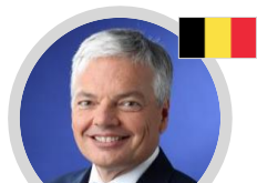
Didier Reynders (RE) Justice