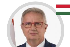
László Trócsányi (EPP) Neighbourhood and Enlargement