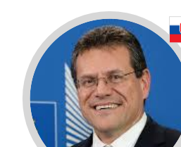
Maroš Šefčovič (S&D) Vice-President for Interinstitutional Relations