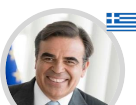
Margaritis Schinas (EPP) Vice-President for European Way of Life