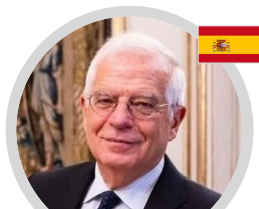
Josep Borrell (S&D) High Representative & Vice President