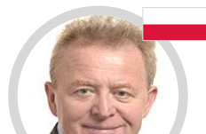
Janusz Wojciechowski (ECR) Agriculture