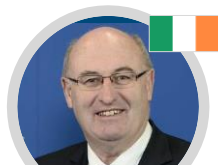
Phil Hogan (EPP) Trade