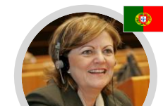
Elisa Ferreira (S&D) Cohesion and Reforms