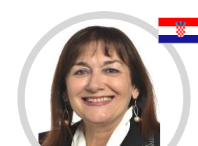
Dubravka Suica (EPP) Vice-President for Democracy and Demography