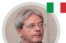
Paolo Gentiloni (S&D) Economy