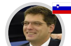
Janez Lenarcic (Ind.) Crisis Management