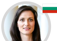
Mariya Gabriel (EPP) Innovation and Youth