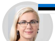
Kadri Simson (RE) Energy