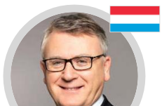
Nicolas Schmit (S&D) Jobs