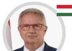
László Trócsányi (EPP) Neighbourhood and Enlargement