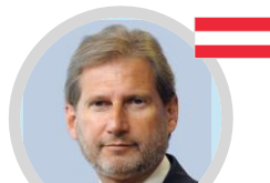
Johannes Hahn (EPP) Budget and Administration